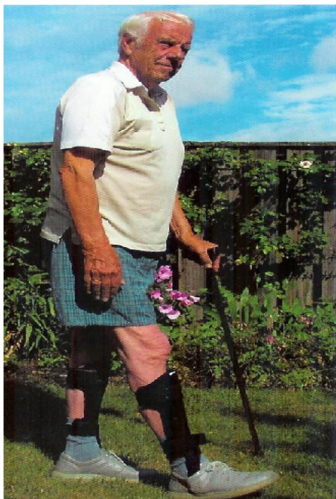
“Gentleman walking with ToeOFF brace.”

allard | USA They may all look alike... ...but there is only one ToeOFF